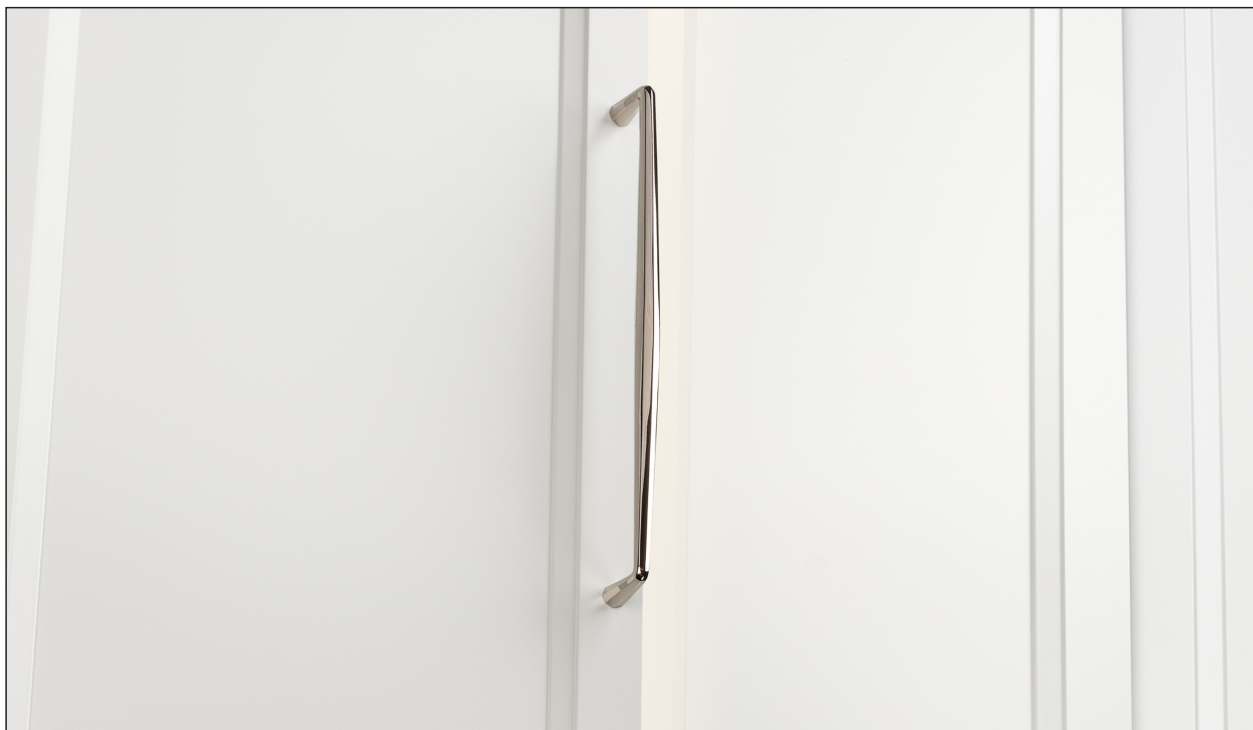
Polished Nickel (Finish ID:8)